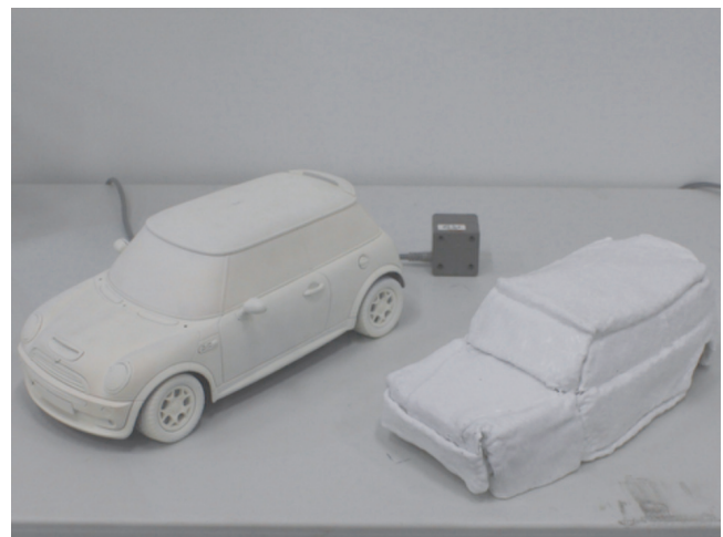
Figure 1: Quimo modelling material mock-up next to a non-deformable material.

Our goal has been to explore how the concept phase of the modeling methodology can be enriched using SAR technologies to allow designers to visualize their concepts with higher detail and provide a more flexible modeling environment.